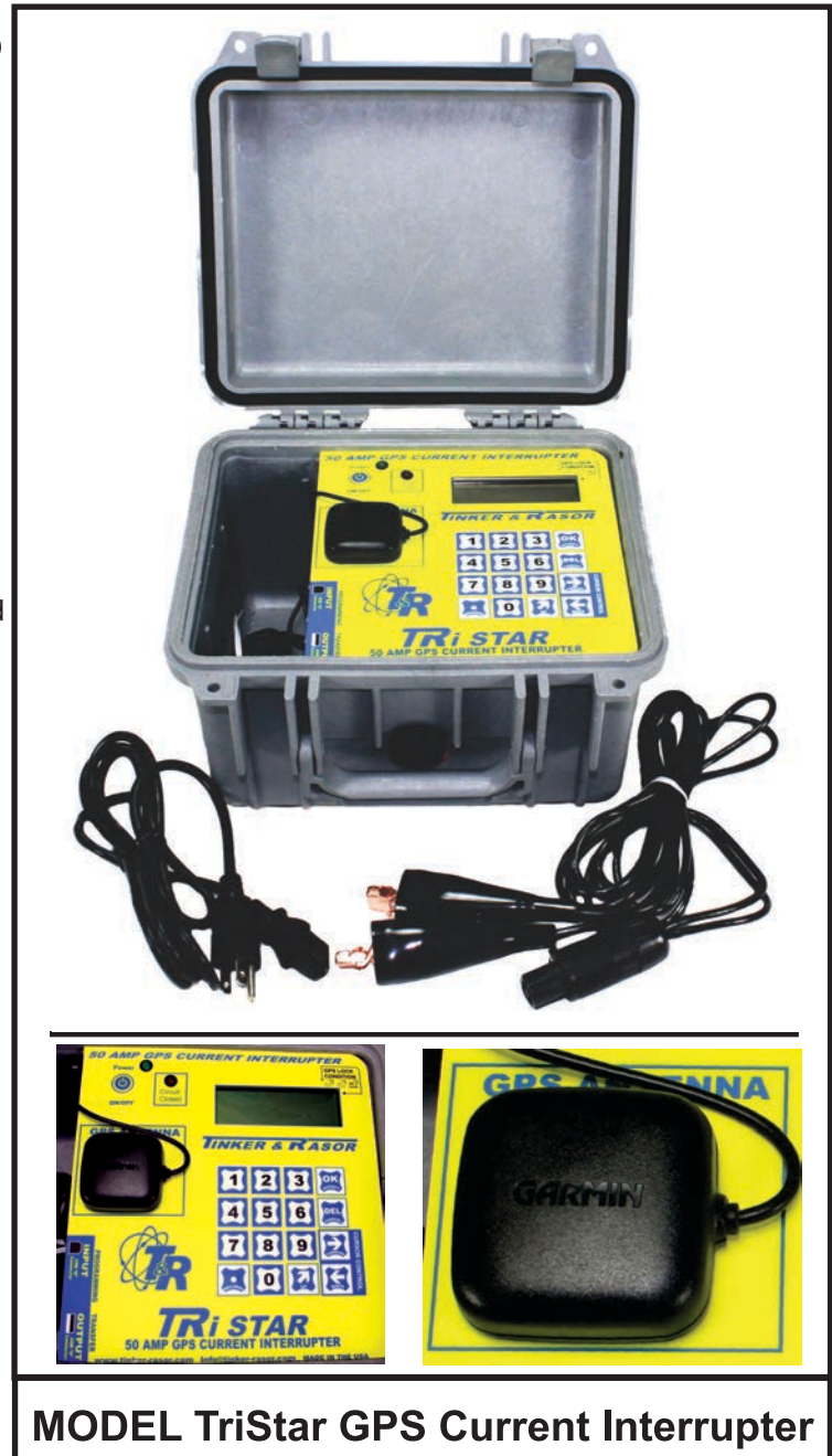
MODEL TriStar GPS Current Interrupter

11" x 7.5" x 10.5", 16 lbs (279.40mm x 190.50mm x 266.70mm, 7 kg)